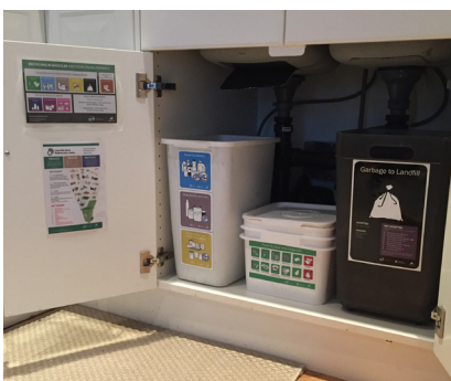
'Stickers and Literature Toolkit': 'Literature Toolkit' plus stickers for bins. $10.00 - $15.00 per unit