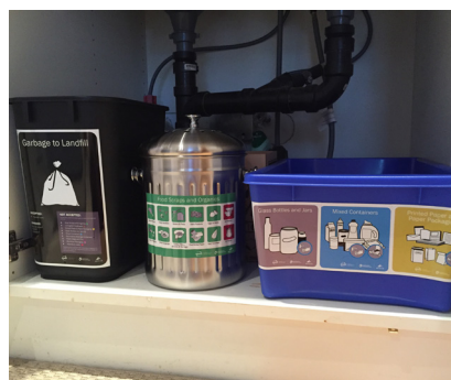
'Full Bin Toolkit': 'Literature Toolkit' plus stickered bins. $20.00 - $60.00 per unit