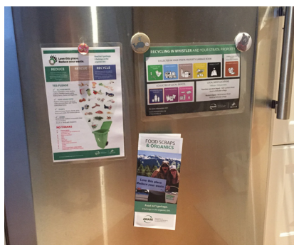
'Literature Toolkit': Educational materials on waste streams collected. $5.00 per unit

Waste audits showed that recycling and organics collection was significantly more successful when occupants were provided with bin labeling kits or the under-sink collection toolkits. Surveys showed that occupants were significantly more satisfied with the support provided to help them prepare for new waste practices when provided with the full under the sink bin kit.