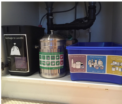
'Stickers and Literature Toolkit': 'Literature Toolkit' plus stickers for bins. $10.00 - $15.00 per unit