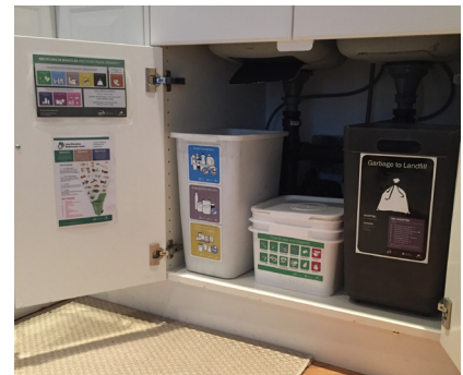
'Full Bin Toolkit': 'Literature Toolkit' plus stickered bins. $20.00 - $60.00 per unit