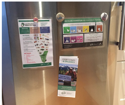
'Literature Toolkit': Educational materials on waste streams collected. $5.00 per unit

Waste audits showed that recycling and organics collection was significantly more successful when occupants were provided with bin labeling kits or the under-sink collection toolkits. Surveys showed that occupants were significantly more satisfied with the support provided to help them prepare for new waste practices when provided with the full under the sink bin kit.